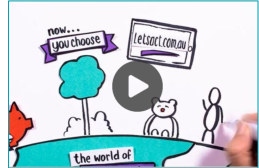
“The World of ACT” Community Sector Banking

Let’s make Social Impact Investing relevant to the everyday person.