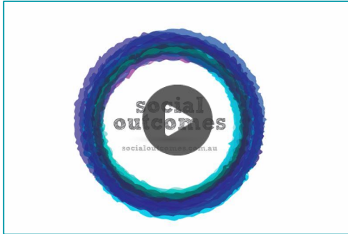
“Bringing Concepts To Life” Social Outcomes

How one organisation uses social and financial innovation to bring outcomes to life.