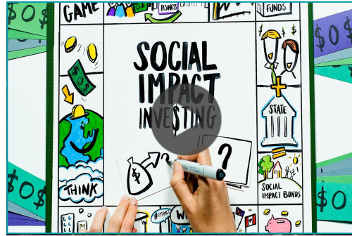
“Your Money” G8 Taskforce for Social Impact Investing

How one organisation uses social and financial innovation to bring outcomes to life.